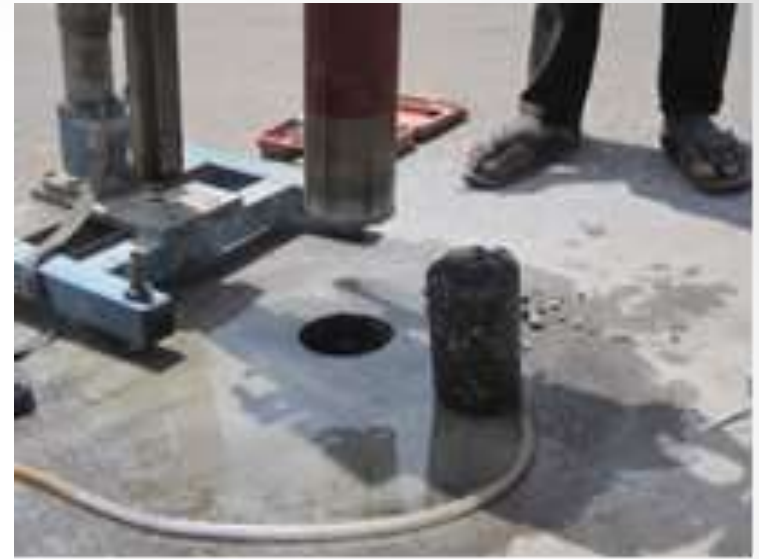
Figure 2: Collection of core samples of asphalt