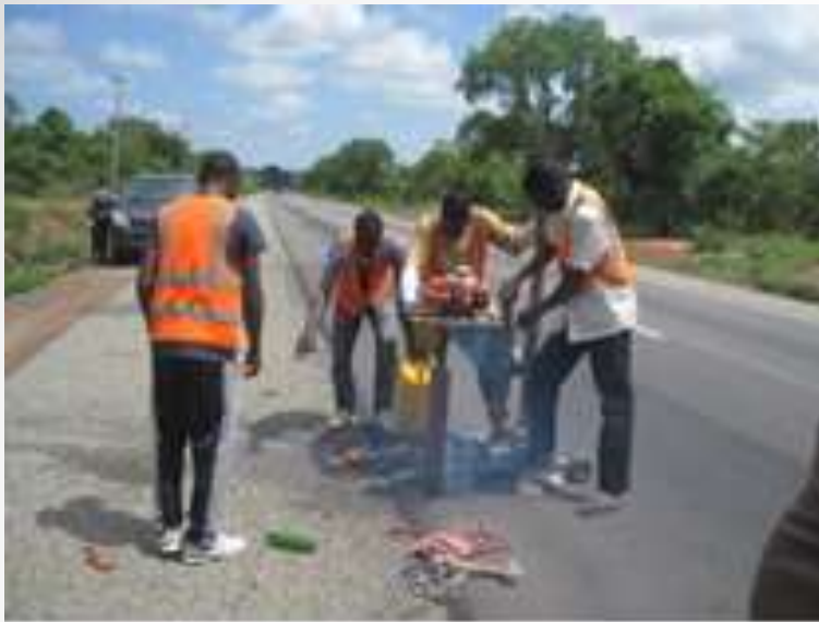
Figure 1: Coring through the pavement structure