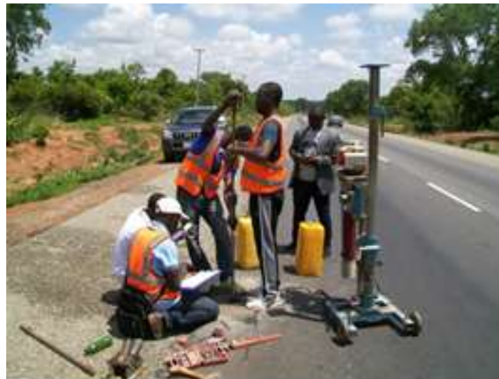
Figure 3: Dynamic Cone penetration test